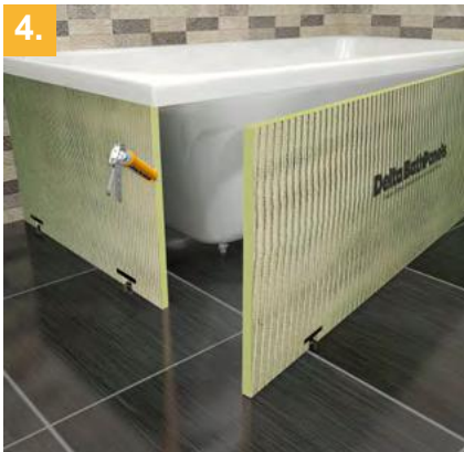
4. If fitting an end panel, apply a bead of DeltaSeal to the end panel and position the side panel.