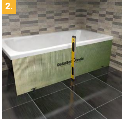
2. Insert Delta BathPanel under bath edge and level.