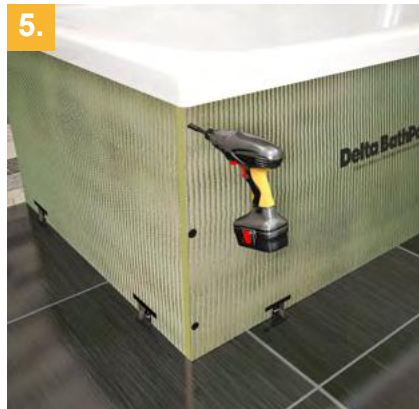
5. Secure the Delta BathPanel using the PCS screws and washers provided.