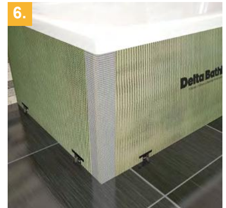
6. Apply DeltaBoard Jointing Tape to the board edges.