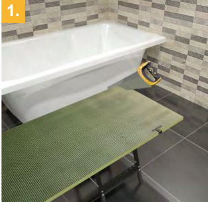
1. Measure the Delta BathPanel and cut to the required size.