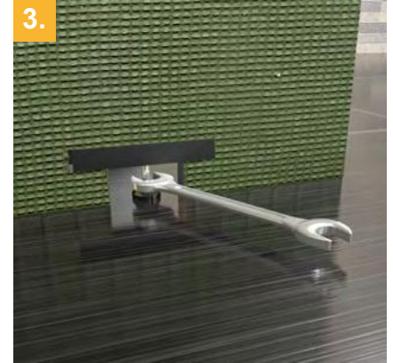
3. Adjust the feet to the required height using a 15mm spanner.